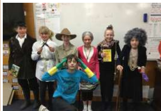
More Book Week Parade Fun: Highly Commended costumes (left) and Dalrmyple Students (right)